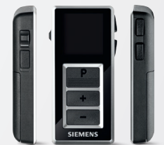
Left side, front, right side